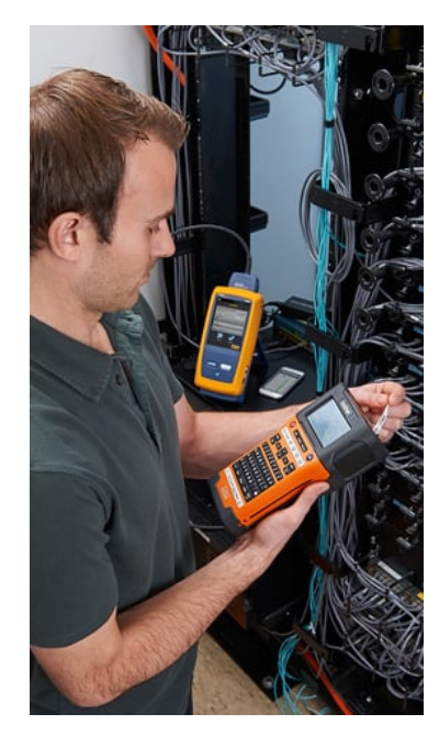
Figure 2. Labeling tools can access the identifiers in the SaaS database to save data re-entry and eliminate labeling errors.

This enhanced workflow is possible because all involved team members can focus on their area of expertise. The Project Manager focuses on the test and quality plan, which involves test regimes, limits and standards as well as cable IDs and naming schemes. In the final stage, the SaaS will also assist the Project Manager in producing the necessary documentation which is often the last milestone before customer invoicing. This leaves the technician to focus on what he was trained to do best: test and troubleshoot.