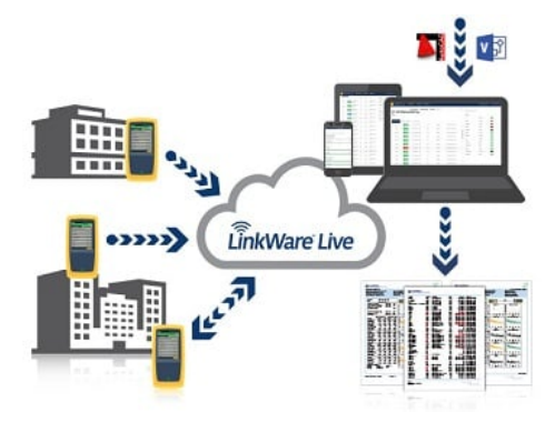
Figure 1. The LinkWare™ Live workflow.

A SaaS for the management of both projects and the cable tester, that also supports list imports of cable IDs from popular tools like AutoCad, Excel™ and VISIO™, not only enhances efficiency but also helps prevent errors. The advantage of such a workflow is obvious if we look at experiences from the past: it was frequently necessary to re-test an entire or a large portion of a project because the first time around the technician had selected the wrong Pass/Fail limits or saved the results using an incorrect cable ID.