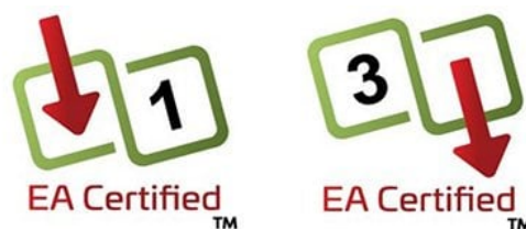
Figure 3. Ethernet Alliance marks for Powered Devices (left) and Power Sourcing Equipment (right).

Designers or installers of PoE equipment can simply compare the marks on the PSE and PD to determine compatibility. If the rating of the PSE is equal to or higher than the requirements of the PD, functionality is assured.