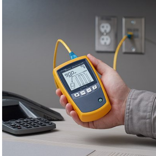
Figure 5. The MicroScanner PoE is Ethernet Alliance Gen2 PoE certified and can detect the power offered by the PSE plus the network's speed, and features a suite of cable testing features.