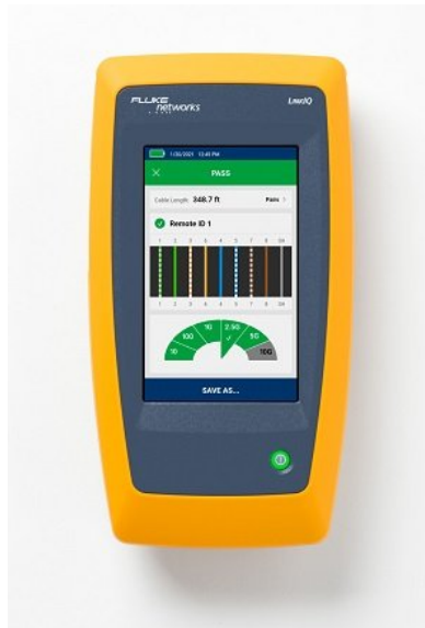
Figure 6.: The LinkIQ Cable+Network tester characterizes cable performance, displays switch port information and detects and loads PoE for thorough measurements.