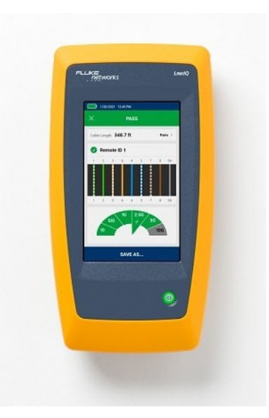
Figure 6.: The LinkIQ Cable+Network tester characterizes cable performance, displays switch port information and detects and loads PoE for thorough measurements.

Figure 5. The MicroScanner PoE is Ethernet Alliance Gen2 PoE certified and can detect the power offered by the PSE plus the network's speed, and features a suite of cable testing features.