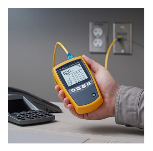
Figure 5. The MicroScanner PoE is Ethernet Alliance Gen2 PoE certified and can detect the power offered by the PSE plus the network's speed, and features a suite of cable testing features.